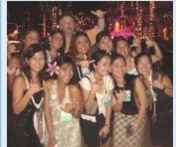
TIM Students at PATA event in Pattaya