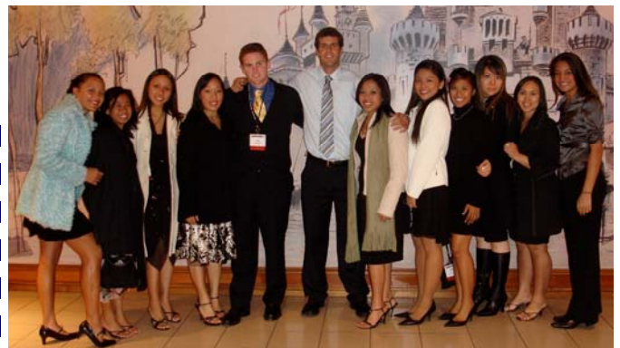
CMAA Members gear up for a social event at the national conference in Anaheim.