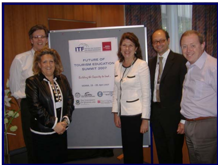
University Sponsors at the Future of Tourism Summit 2007

different future scenarios to discuss in the context of tourism and education. The debates were lively and provocative and generated two items - a set of values that participants felt should be the foundation for future educational programs, and a set of megatrends that tourism will most likely be affected by. Summit attendees left with a true appreciation of the need for more futures education in tourism and the commitment to change their curriculum to reflect this need. It was the consensus of the group that more work was needed to generate concrete recommendations to further the initial debate at the Summit. The initiative will continue with informal discussions on line at www.tourismeducationsummit.com and at meetings at the BEST Education Network Think Tank in Arizona and at the UNWTO Education Council meetings in June.