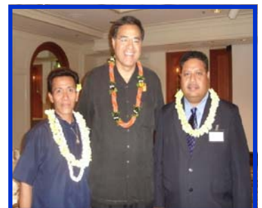
EDIT Participants with Mayor Mufi Hannemann.